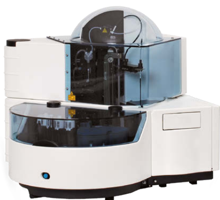
B·R·A·H·M·S KRYPTOR compact PLUS